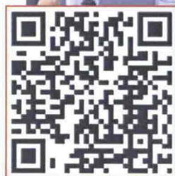
Videos on Made Expo